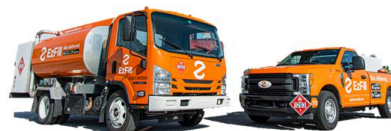
An EzFill Mobile Delivery Truck

EzFill provides customers in South Florida the ability to have fuel delivered to their vehicles (cars, trucks, and specialty vehicles) without having to leave the comfort of their home, office, and job site. EzFill's app-based platform conveniently brings the gas station to customers with a growing fleet of EzFill-branded, Mobile Fueling Trucks. EzFill's business verticals align to the high-use, high demand cases in vehicle operations. These are; individual CONSUMERS , COMMERCIAL entities and SPECIALTY vehicle markets.