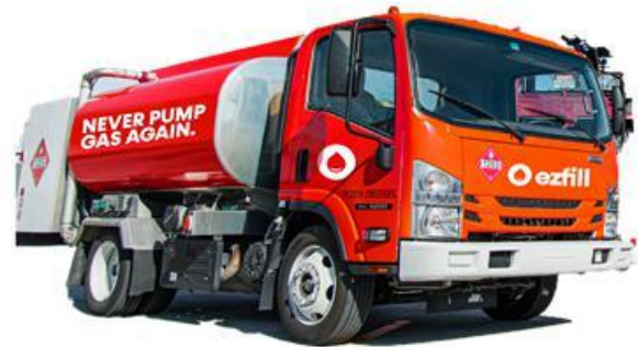
An EzFill Mobile Delivery Truck

EzFill provides customers in South Florida the ability to have fuel delivered to their vehicles (cars, trucks, and specialty vehicles) without having to leave the comfort of their home, office, and job site. EzFill's app-based platform conveniently brings the gas station to customers with a growing fleet of EzFill-branded, Mobile Fueling Trucks. EzFill's business verticals align to the high-use, high demand cases in vehicle operations. These are; individual CONSUMERS , COMMERCIAL entities and SPECIALTY vehicle markets.