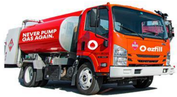
An EzFill Mobile Delivery Truck

EzFill provides customers in South Florida the ability to have fuel delivered to their vehicles (cars, trucks, and specialty vehicles) without having to leave the comfort of their home, office, and job site. EzFill's app-based platform conveniently brings the gas station to customers with a growing fleet of EzFill-branded, Mobile Fueling Trucks. EzFill's business verticals align to the high-use, high demand cases in vehicle operations. These are; individual CONSUMERS , COMMERCIAL entities and SPECIALTY vehicle markets.