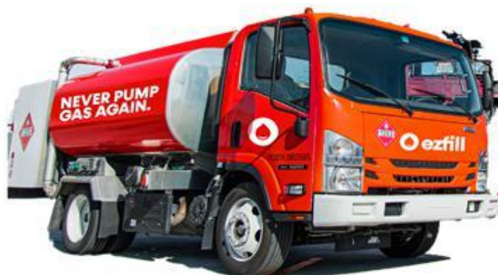
An EzFill Mobile Delivery Truck

EzFill provides customers in South Florida the ability to have fuel delivered to their vehicles (cars, trucks, and specialty vehicles) without having to leave the comfort of their home, office, and job site. EzFill’s app-based platform conveniently brings the gas station to customers with a growing fleet of EzFill-branded, Mobile Fueling Trucks. EzFill’s business verticals align to the high-use, high demand cases in vehicle operations. These are; individual CONSUMERS , COMMERCIAL entities and SPECIALTY vehicle markets.