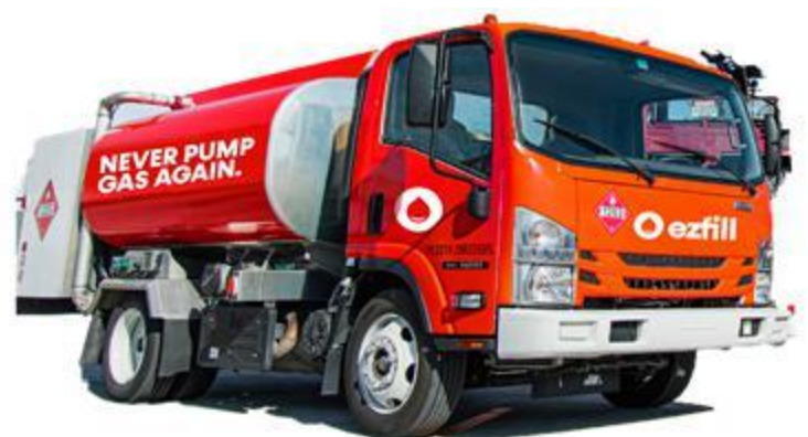
An EzFill Mobile Delivery Truck

EzFill provides customers in South Florida the ability to have fuel delivered to their vehicles (cars, trucks, and specialty vehicles) without having to leave the comfort of their home, office, and job site. EzFill's app-based platform conveniently brings the gas station to customers with a growing fleet of EzFill-branded, Mobile Fueling Trucks. EzFill's business verticals align to the high-use, high demand cases in vehicle operations. These are; individual CONSUMERS , COMMERCIAL entities and SPECIALTY vehicle markets.